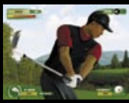
All-new dual analog swing.

Your heart will pound. Your hands will sweat. Your mind will race. That's what it's like to play golf with Tiger.