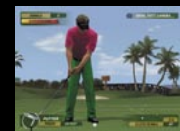
All-new dual analog putting.