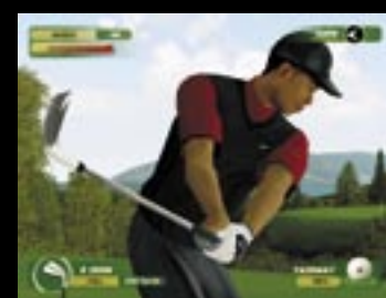
All-new dual analog swing.

Your heart will pound. Your hands will sweat. Your mind will race. That's what it's like to play golf with Tiger.