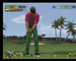
All-new dual analog putting.